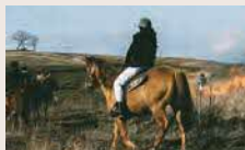
Events utilizing grasslands