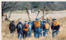
PR activities to increase volunteers and donations