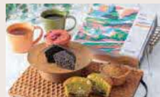
Collaborative products to fund grassland conservation