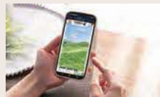
Project website creation and administration